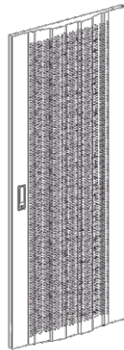
Front Perforated (Curved)